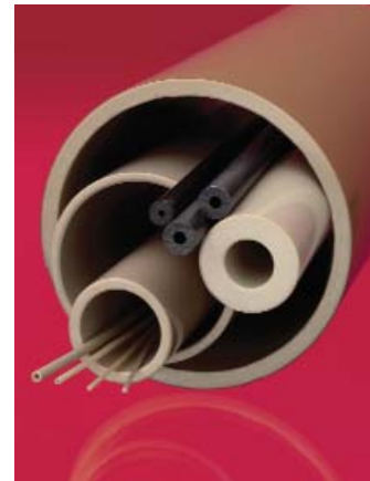
High performance PEEK Coretec pipes and tubes are available in a wide range of diameters and wall thicknesses.