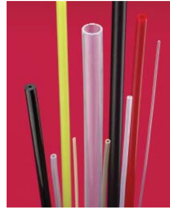
SWM International manufactures an extensive collection of fractional tubing, in multiple materials and colors.

Needs SWM recognizes the value of providing customized solutions to our partners. We build relationships with both our customers and our suppliers to ensure that we offer the best quality and service. We stay current on high-performance material issues to aid in product selection. We offer same-day shipments, drop shipments, and stocking agreements, as well as product customization per application. We strive to maintain high quality and achieve customer satisfaction with every order.